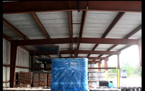
6,000sf Open Front Storage