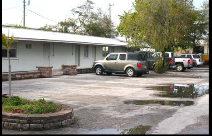
4,575sf Showroom & Offices