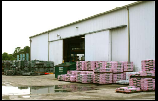
8,845sf Warehouse with 20' Walls, Doors on 3 Sides